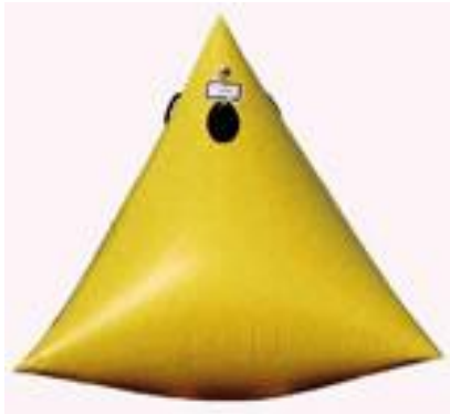
Over inflated Mark Bottom should be flat, Corners should pooch down.

Storage Carefully using Boat Hook retrieve anchor line and anchor for storage. Store anchor and extensions. To deflate unscrew and remove inflation valve cap. When deflated, fold in thirds and roll for storage.